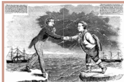
The laying of the cable---John and Jonathan joining hands